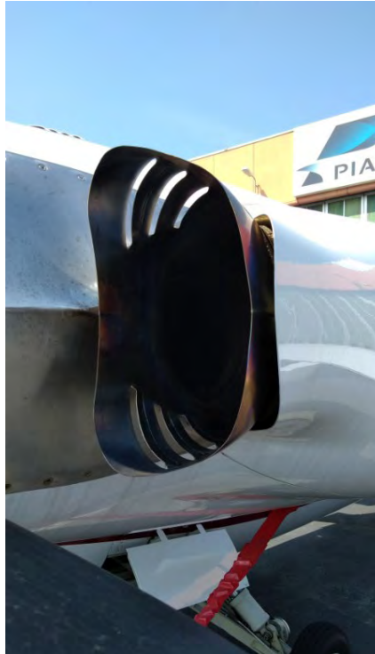
New Engine Exhaust Ducts