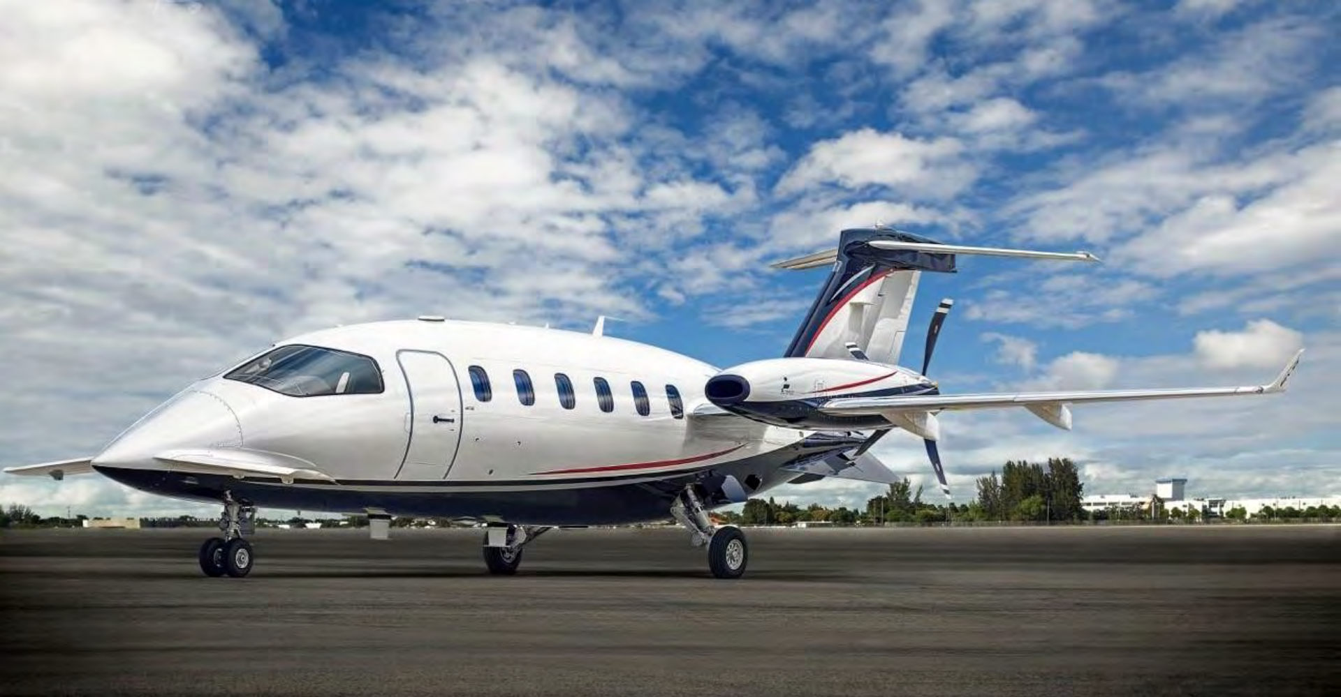
Custom Paint – Overall Matterhorn White with Sunfast Red, Superjet Black and Bright Aluminum Stripes

Specifications as March 7, 2019. Specifications are subject to verification upon inspection and should not provide a basis for reliance or create any other binding obligation.