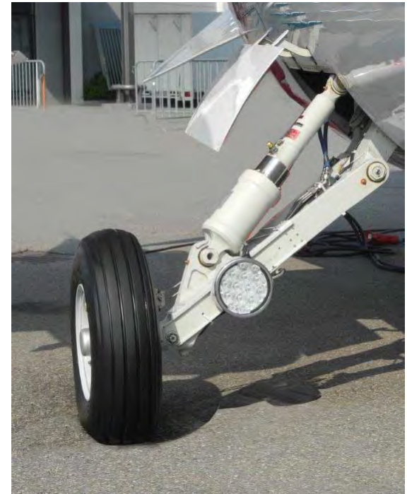
New Landing Gear with automatic steering and anti-skid systems