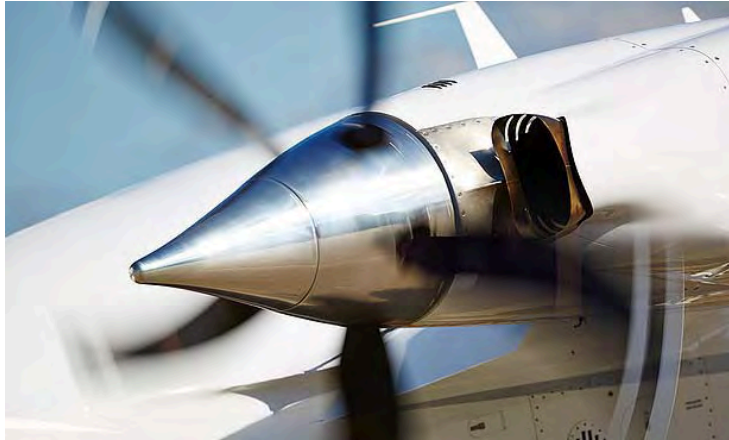
Hartzell HC-E5N Five-Blade Scimitar Props