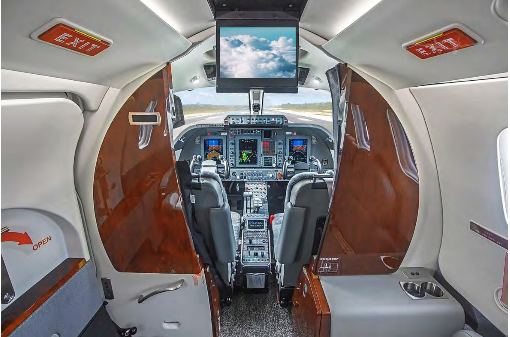
Specifications as March 7, 2019. Specifications are subject to verification upon inspection and should not provide a basis for reliance or create any other binding obligation.